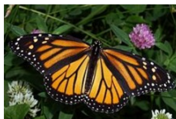
Female Monarch butterfly (Wikipedia)