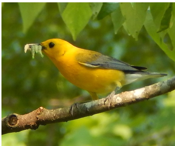
Top, Common Spatterdock or Yellow Pond-lily ( Nuphar advena ). Right, Prothonotary Warbler ( Protonotaria citrea )