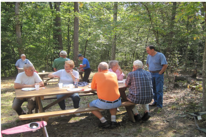
Annual Picnic is September 28