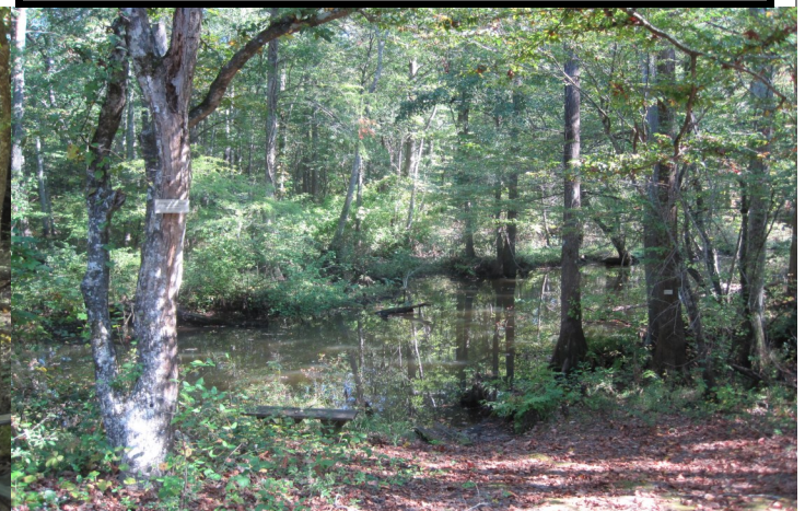
Picnic Area View on Big Island