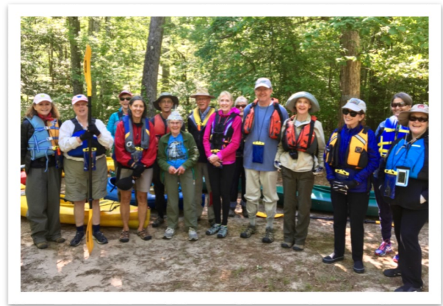
TOP LEFT TO RIGHT—MAY 1 st , 2 nd , 6 th and MAY 9 th PADDLING GROUPS.